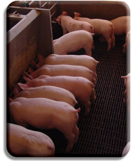
Cutline: While we often talk about one national supply chain of pork (for example), the reality is that the U.S. food system is made up of smaller regional and local supply chains that are very finely balanced and built around "just in time" inventory systems.

Because the system is built around efficiency, most business up and down the supply chain (from processors to brokers to retail and food service operations) only have storage capacity for a few days' supply. When something like a large-scale restaurant closure, shelter-in-place orders, panic buying, or a processing plant closure happens, it has a major impact on the system. When all those things happen simultaneously like it did during the early stages of the pandemic, it throws the system into temporary disarray. Fortunately, we had tal-